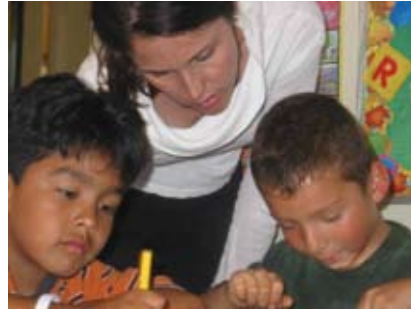
HOLA students enjoy educational and recreational activities at a safe and caring environment in the heart of the troubled Rampart District.

With over 700 gangs containing 80,000 members county-wide, Los Angeles is now considered the “gang capital of the world.” Many believe the key to resolving this crisis is not suppression and incarceration, but intervention and prevention. As L.A. County Sheriff Lee Baca has commented, “You can’t arrest your way out of a gang problem. The real problem is these young people don’t have an alternative for gangs.” HOLA’s programs provide just such an alternative in a neighborhood whose youth need it most.