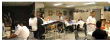
Thanks to Everychild's support, the Optimist Youth Home now provides 150 students with art, music, and other therapy.

helped these young people overcome the negative experiences of their youth in order to lead meaningful lives.