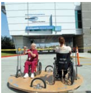
From top to bottom: 1) Two future playground users visit the construction site; 2) OHMMHS students exhibit a popsicle-stick model of a universally accessible merry-go-round they designed; 3) Cal State mechanical engineering students test some of the mechanisms to be used in the prototype design; 4) wood-frame mockup of the base; 5) prototype merry-go-round gets taken for a "test spin" by LAOH staff members.

Since the ground-breaking ceremony last summer at Los Angeles Orthopaedic Hospital, work has progressed steadily on the universally accessible playground funded by Everychild Foundation's $925,000 grant in March, 2006. As Mary Schmitz, President of the Los Angeles Orthopaedic Hospital Foundation, reports, "The excitement you felt when you first gave Orthopaedic Hospital this gift has just grown over the year. The reality of the playground coming into being was heralded as such a symbol of hope and...well, playfulness for our donors, our support groups, our doctors, nurses, therapists, students at the Orthopaedic Hospital Medical Magnet High School – and just about anyone who will give us a moment to describe this project."