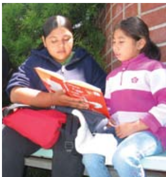
Students reading at the HOLA facility