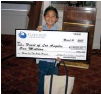
¡Hola! Now that truly IS a large check!

The annual Everychild luncheon is always a heartwarming affair, a chance for members to come together, present their newest grant, and acknowledge the achievements of the Foundation and its previous grant recipients. This year at the March 14 th luncheon there was special cause for celebration, as Everychild fulfilled its dream of presenting its first $1 million grant, awarded to Heart of Los Angeles Youth (HOLA). Present to receive the ceremonial check from the Everychild Executive Board were