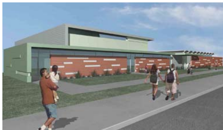
Above: Rendering of the renovated HOLA facility. Below: To touch or not to touch?

In partnership with the Los Angeles Department of Recreation and Parks, HOLA will use the $1 million grant to improve their current facilities in Lafayette Park. HOLA is currently in the process of finalizing negotiations with the City and expects groundbreaking for the project to occur in late 2007. Leveraging Prop K funds already dedicated to expand and renovate the existing Community Center, they will use Everychild funds to add a technology learning center, classroom space, and offices for HOLA program staff. A portion of the funding will also be used to expand HOLA's existing programs in academic enrichment, computer literacy, job training, fine arts and athletics. As a result, 900 additional children will be able to take advantage of HOLA's programs each year, bringing the total program capacity to 2300 children. (cont'd on back page...)