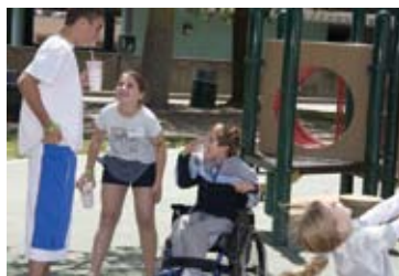
Children of all abilities play together at Aidan's Place Universally Accessible Playground during Everychild's 6 th annual Family Day.

Since the Everychild Youth Learning Center was dedicated in November, 2005, Optimist Youth Homes and Family Services has significantly expanded many of the services they provide to the troubled adolescents who live at their Highland Park campus.