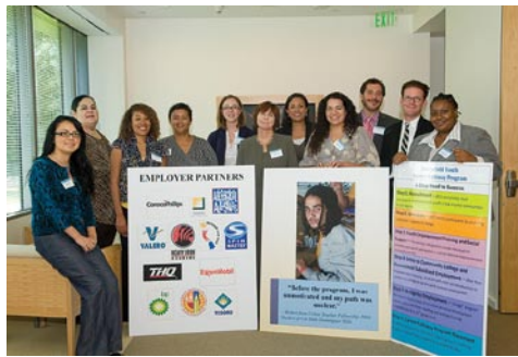
The SBCC team at the Everychild grant hearing