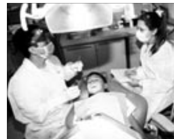
The Mobile Dental Program has served 12,000 children at inner-city schools.

For more information about QueensCare, please visit www.queenscare.org .