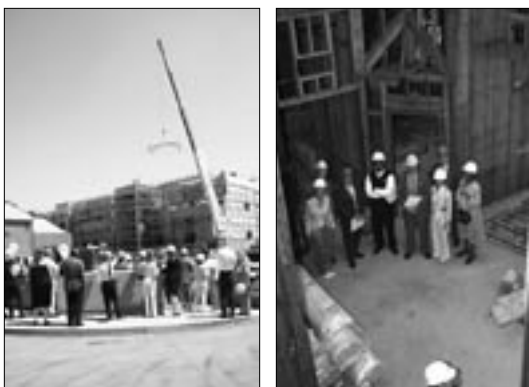
The Everychild Foundation Youth Learning Center will address the special needs of severely disturbed adolescents. The building will be dedicated on September 8, 2005.