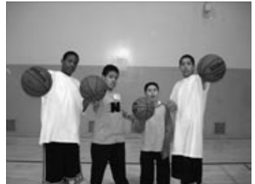
More than 40 athletes participated in this year's Prime Time Games, twice the number from last year.

For more information about Team Prime Time, please visit www.teamprimetime.org .