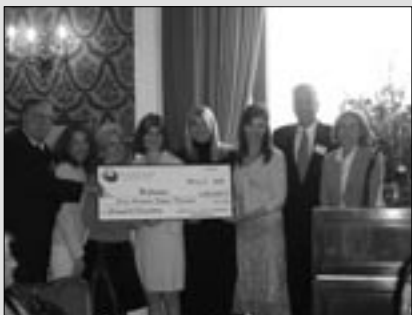
Everychild presents Hillside with a $715,000 grant at the annual luncheon in March.

The members of Everychild urge all interested women to join us now, while there are still spaces open. Listening to speaker after speaker at this year's luncheon talk about the children whose lives we've touched, it was clear to all of us that membership in the Everychild Foundation is a gift we give ourselves – the gift of knowing that together, we've really made a difference.