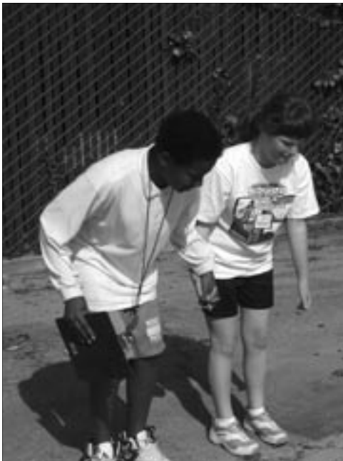
Team Prime Time students work as athletic coaches for children with disabilities.