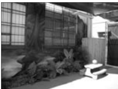
The Everychild CVC offers the only 24-hour program for abused children in Los Angeles. Above, one of the center's therapy rooms and a play yard mural.