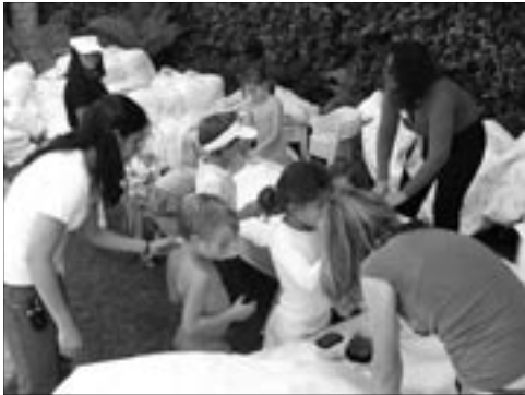
Everychild children decorate blankets for distribution to homeless children and teens throughout Los Angeles.