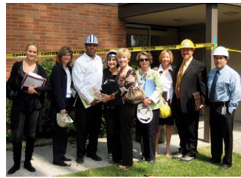
Members of the GMB visit the HOLA construction site.

The Grant Monitoring Committee (GMC) is charged with oversight of all Everychild grants. Including this year's grant to Mar Vista Family Center, the committee currently conducts active oversight on four separate grants. The committee's work commences before completion of the grant agreement to make certain Everychild has adequate oversight authority. Monitoring continues for a period of three years following completion of the disbursement of project funds.