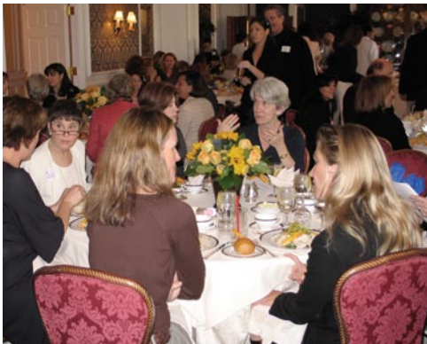
Members enjoy socializing at the Annual Luncheon held at the Regency Club in Westwood.