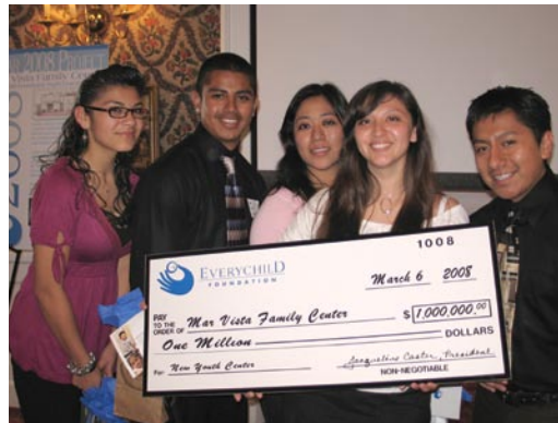
Mar Vista staff and clients are in a celebratory mood as they see their dream of a new center becoming a reality.