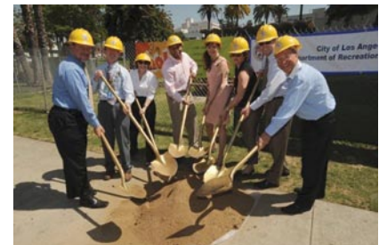
Ground-breaking for the Mar Vista Family Center