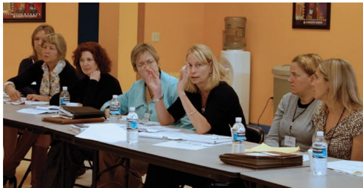
GSB members hold seven formal meetings, culminating in a final vote.

The GSB's role begins with a list of potential grantees in January and ends with a joyous telephone call to one of them in November. In between many hours are spent in meetings, in smaller groups examining financial reports and proposal details, and on the road to informative site visits.