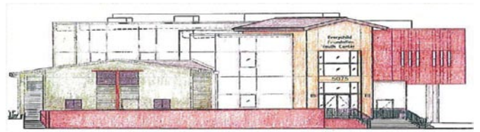
The Youth Center will be the anchor for the entire Mar Vista complex

Mar Vista Family Center was founded in 1977 as a community pre-school seeking to engage parents as partners in their children's education and social development. It has served more than 1,000 families since its inception. The cornerstone of the agency's philosophy is personal responsibility and empowerment through education and leadership training. Community involvement is deeply imbedded