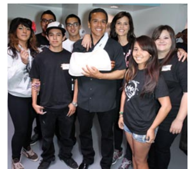
Right: Everychild Urban Arts Crew youth painted a mural in South Los Angeles Animal Shelter with Mayor Villaraigosa