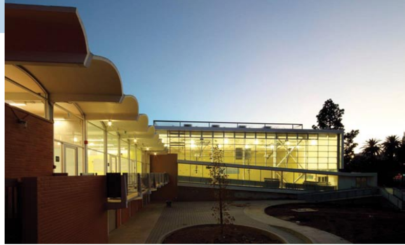
Top: The new, architecturally distinct Lafayette Park Recreational Center

Lafayette Park serves the most densely populated and ethnically diverse area in Los Angeles and was severely under-served. The current economic reality has made this success story all the more powerful, and it will clearly serve as a model for future private/public partnerships in the city parks.