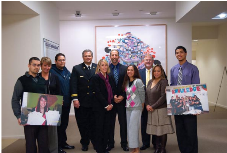
The BGCLAH group at the Everychild grant hearing

BGCLAH plans to expand College Bound to an additional 600 youth at its three main sites and an additional 3000-3500 youth at ten other clubs within the LA Alliance. In addition, BGCLAH will promote replication of College Bound through "The Everychild College Bound University", a web-based program available to the remaining Boys and Girls Clubs of the Los Angeles Alliance, potentially serving 5000 additional youth. It will also be available to 180 Boys and Girls Clubs throughout California as well as YMCAs, YWCAs, and public and charter schools in the state – potentially serving an additional 25,000 to 50,000 youth over the term of the two-year grant.