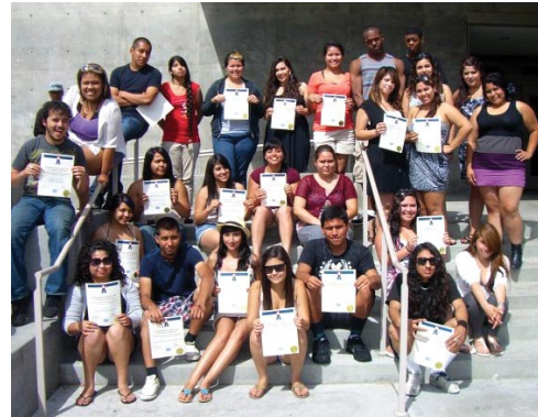
Top: Everychild Urban Teacher Fellowship Youth at Los Angeles Harbor College

The Everychild grant has also been instrumental in leveraging significant public investment to support this youth employment strategy, including three CalGRIP grants issued as part of the Governor's office's gang prevention strategy. These grants are centered on youth employment programs at Cerritos, Mission, Santa Monica and Harbor Colleges, all of which involve SBCC as the primary nonprofit partner. The grants will provide approximately $2 million in funding to support strategies aligned with and positioned to serve youth participating in SBCC's Everychild-funded initiatives.