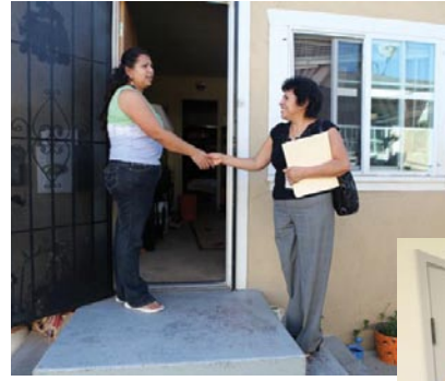
Top: A St. John's counselor meets with a mother to discuss asthma prevention for her children.