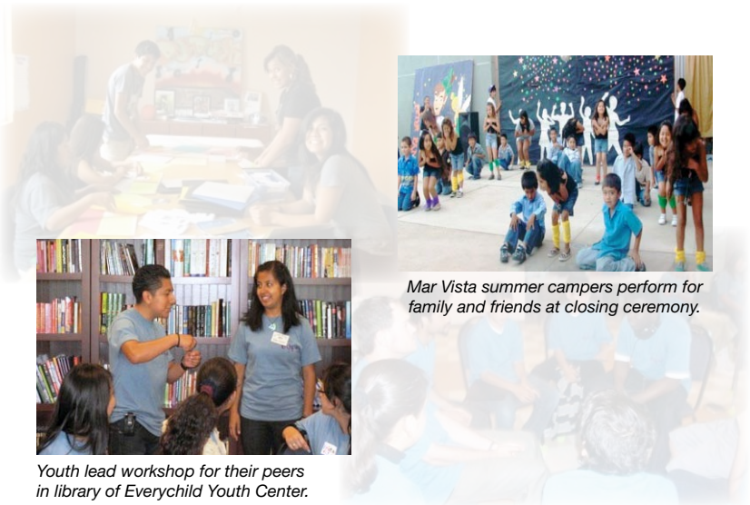
Youth lead workshop for their peers in library of Everychild Youth Center.

The busy Everychild Foundation Youth Center serves approximately 900 children and teens annually. The Center has had particularly strong success with its College Prep Program. Beginning when students enter middle school, the staff engages youth and their parents with the objective of encouraging the goal of college in every home. A full 100 percent of the Center’s seniors from the Class of 2010 are now attending college. Other programs for youth include computer skills, exercise, sports, creative arts and dance classes, advocacy and leadership training and peer counseling. Another successful Mar Vista program – By Youth for Youth – continues to expand its activities and now provides services for 300.