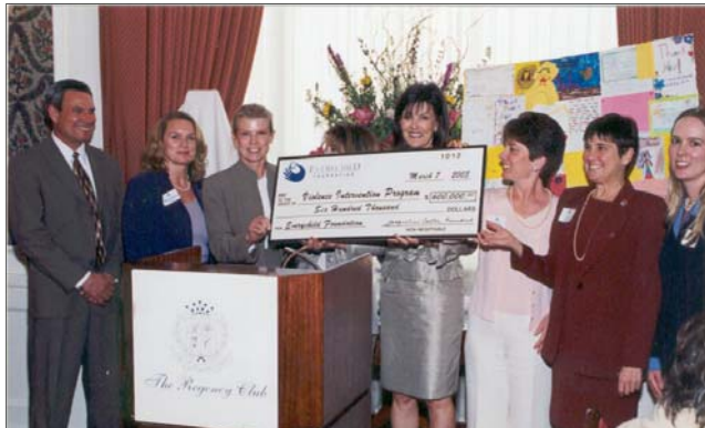
The Everychild Foundation announced its 2003 grant award of $600,000 to the Violence Intervention Program at the foundation's annual membership luncheon on March 7, 2003 at the Regency Club in Los Angeles.

The Everychild Foundation has awarded a $600,000 grant in support of the Violence Intervention Program's (VIP) capital campaign to renovate a historic building. The funds will allow the VIP to renovate its East Los Angeles facility and continue to expand services for children who are victims of child abuse and family violence. VIP looks forward to renaming that part of its program that deals with child abuse the Everychild Foundation Center for the Vulnerable Child.